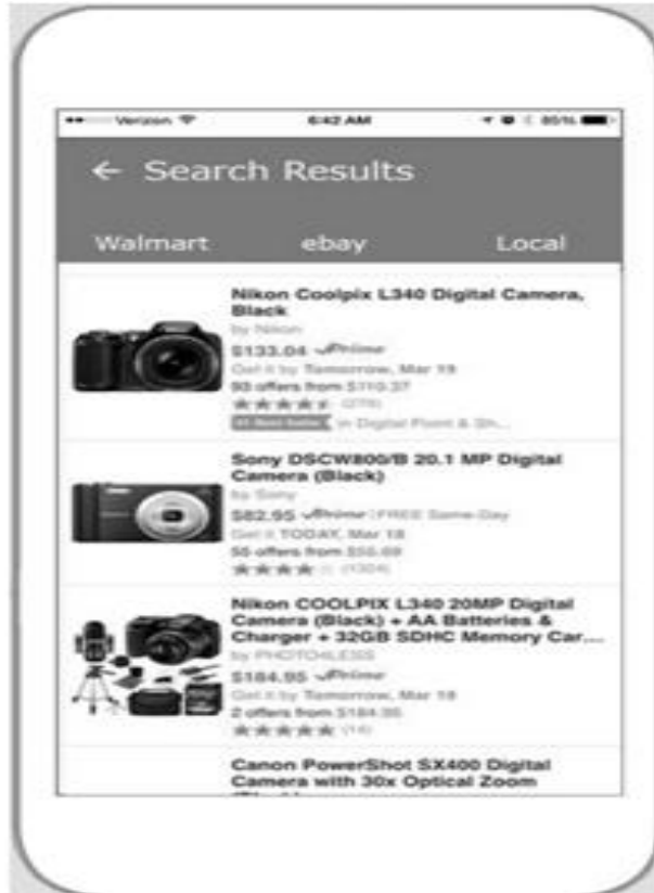
Figure 4: Results view of Mobile App

A typical searching based on the keyword and price range result on the online shopping sites and local market given an in the above Figure 2. The search result window will mainly display the image of the product, product name, product brand, price range and ratings. On the top of the window, it will show all the online shopping sites in our application as tabs. It will only show Walmart, eBay and local market tabs for the time being. When we get to add the other online shopping sites to the application, they will be shown on the top of the window.