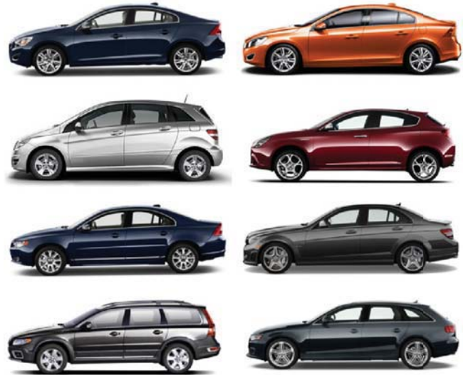
Fig. 3. Example images of side-view cars. (row-1) coupe, (row-2) hatchback, (row-3) sedan, and (row-4) wagon types of cars

For constructing visual vocabularies, we manually labelled the wheels in 20 car samples and extracted e-SURF descriptors. The descriptors from wheel images were clustered using the K-means method with K = 100 to constructing a vocabulary for wheels. Similarly a background vocabulary was also constructed using the descriptors from background images